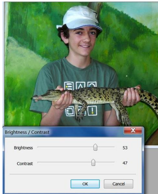
Lighten an image