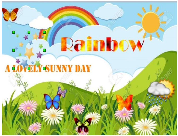
Butterflies, Sun, Stars, Rain shower, colourful text